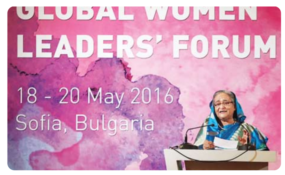
Prime Minister Sheikh Hasina addressing at the Global Women Leaders' Forum

Women's participation and engagement as one of the main drivers of national development is firmly embedded in the national development plans and budgets. We spend over 2% of our GDP for social protection coverage. Most of the beneficiaries of social protection are the less fortunate and destitute women.