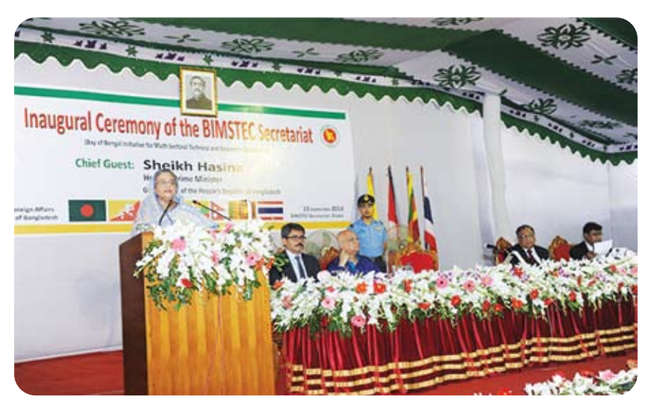
Prime Minister Sheikh Hasina addressing at the inaugural ceremony of the BIMSTEC Secretariat

The establishment of BIMSTEC Secretariat is a major leap forwards regional cooperation and integration. I believe, the secretariat will not only play its rightful role in implementing the BIMSTEC's programmes and projects but also be creative in bringing new ideas and initiatives for cooperation in our region.