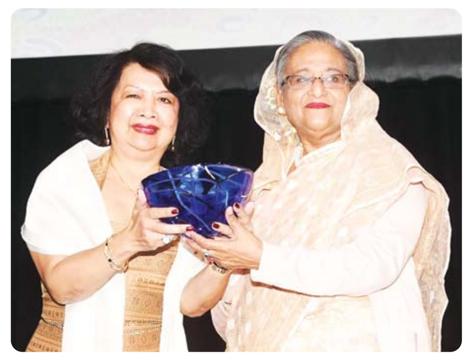
Prime Minister Sheikh Hasina receiving 'Global Women's Leadership Award' 2018 from The Global Summit of Women for successful women leadership in the world, Australia, 27 April 2018

Bangabandhu made girls education free up to class VIII and preserved 10% quota for females in the government jobs.