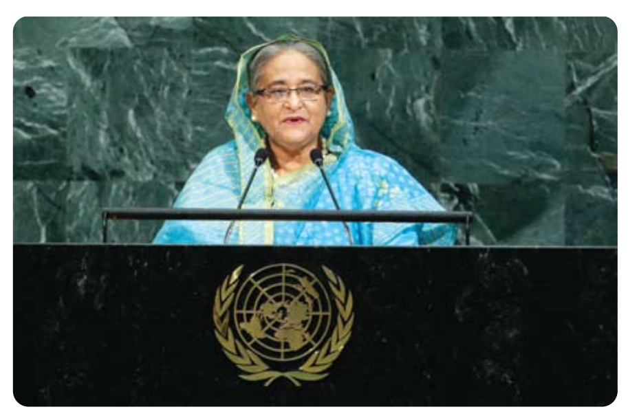
Prime Minister Sheikh Hasina addressing at the 72<sup>nd</sup> Session of UNGA

At the same time, I condemn all kinds of terrorism and violent extremism too. Our government maintains a 'zero tolerance' policy in this regard.