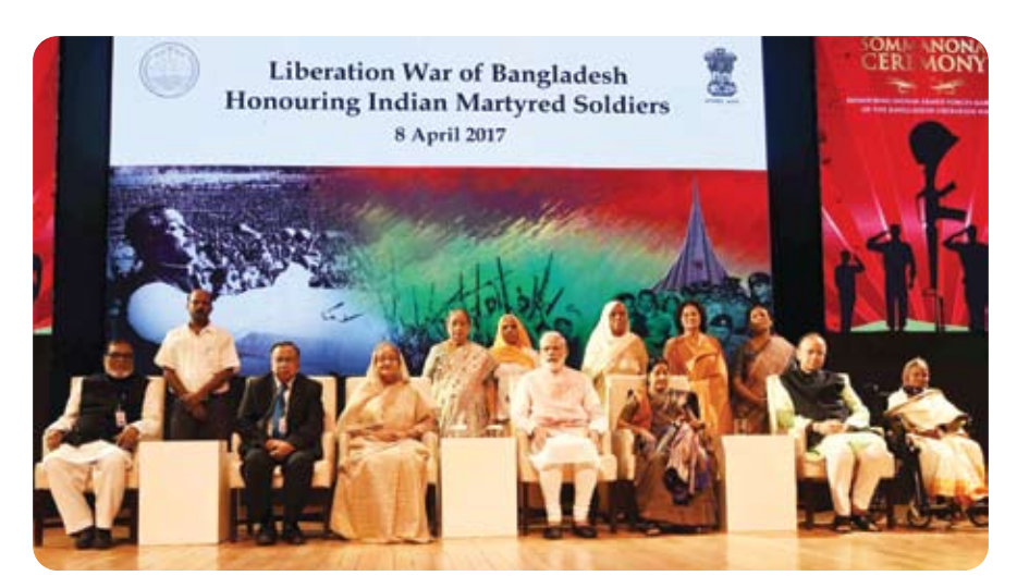
Prime Minister Sheikh Hasina at the event of Honouring Indian Martyrs of 1971