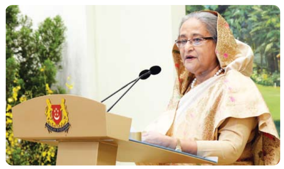
Prime Minister Sheikh Hasina delivering speech at a luncheon hosted by the Prime Minister of Singapore

Singapore continues to be a favourite destination for Bangladeshi workers. I hope that Singapore will continue to provide them with a decent work atmosphere.