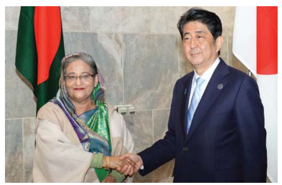
Prime Minister Sheikh Hasina meets with Japanese Counterpart Shinzo Abe

self-sufficiency in food; raised per capita income by 67 percent; reached ICT services all across the country; attained huge progress in health and education. We want build a knowledge-based nation; develop our rich human resources and undertake massive infrastructural developments where Japan can contribute further. Japan can also support inclusion of international migration and the security climate vulnerable countries as Bangladesh in the post-2015 UN Development Agenda.