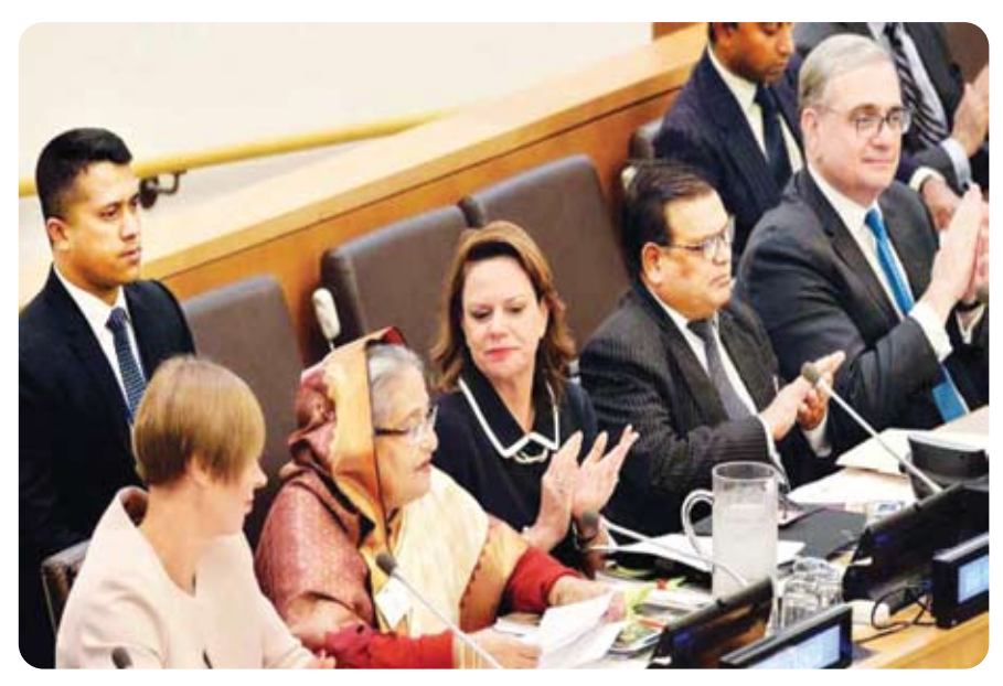
Prime Minister Sheikh Hasina at a meeting with world leaders during 72^{nd} UNGA

of each SDG, along with the indicators. It is an innovative platform that takes advantage of the massive data revolution. With the launch of the SDG Tracker, we are making it available for countries in the south.