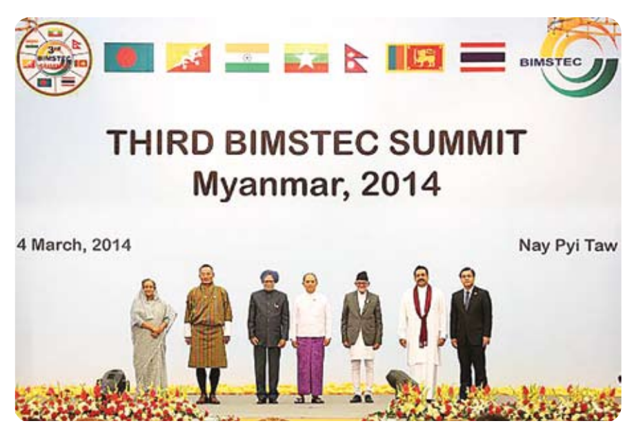
Prime Minister Sheikh Hasina at the 3rd BIMSTEC Summit.

The connectivity strategy and the resulting economic activities would greatly support the BIMSTEC 'Poverty Plan of Action' for quickening the process of poverty alleviation in our region.