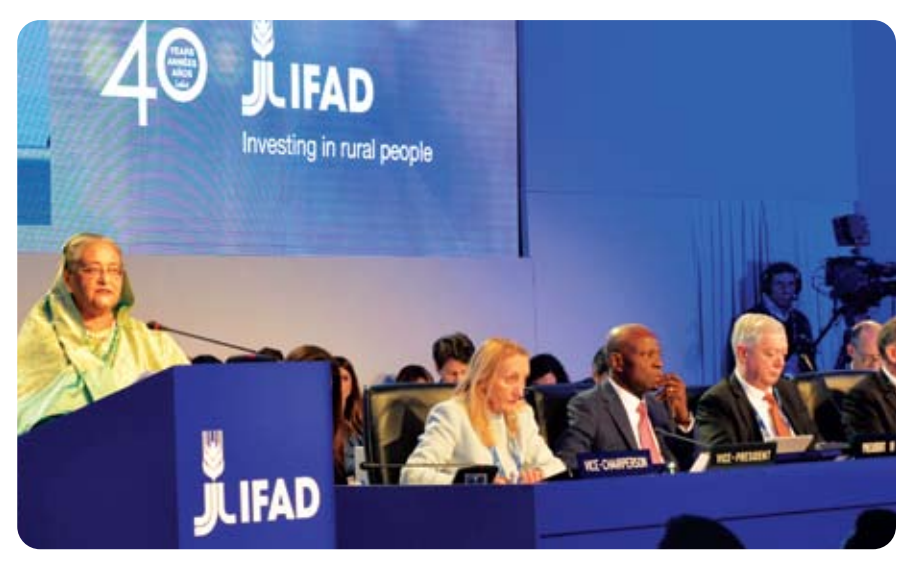
Prime Minister Sheikh Hasina delivers speech at the 41st session of the IFAD's governing council

class. There will be a huge strain on declining global arable land, forests and water.