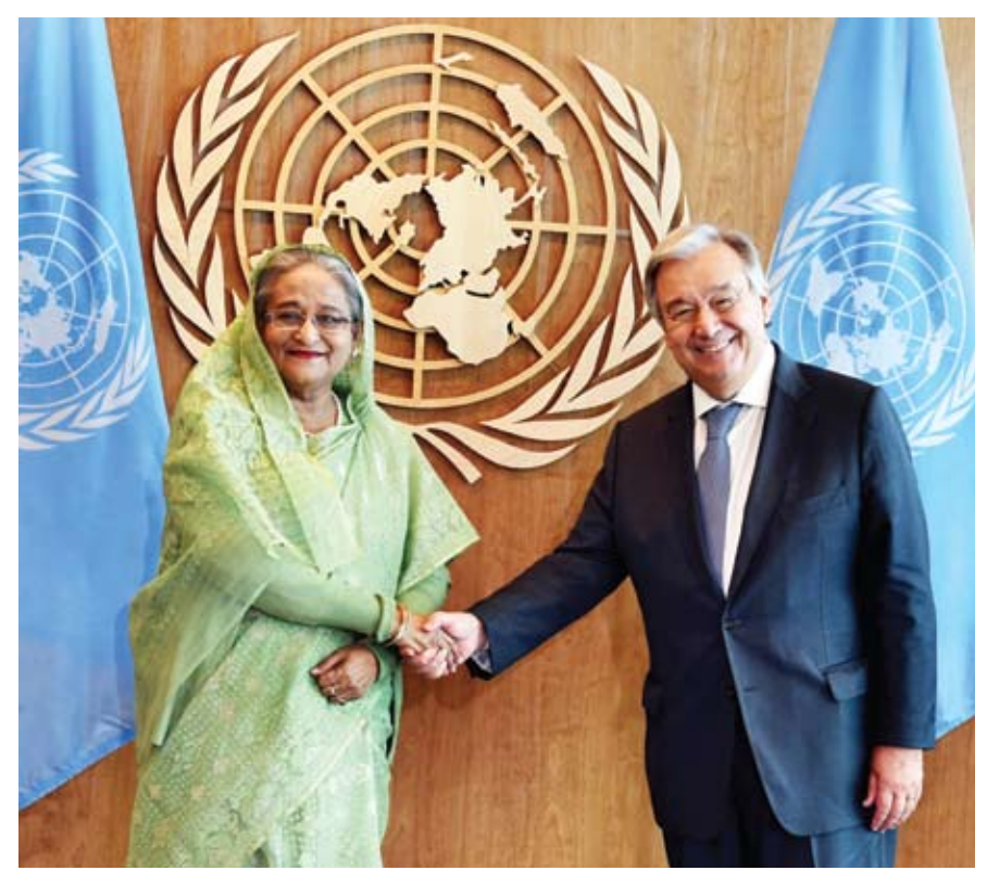
Prime Minister Sheikh Hasina meets with UN Secretary General Antonio Guterres at New York on 27 September, 2018

health care service has reached to people's doorsteps. 30 different types of medicines are being distributed free of cost. Tuberculosis prevention and control efforts have been intensified to reach the 2030 SDG target. As a result, TB related deaths have reduced by 19% in the last two years.